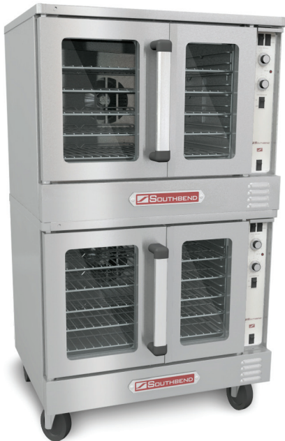
SLGS/22SC shown with optional casters

OPTIONAL NRG System required for rebates. NRG System units are Energy Star Approved. (Standard Depth Only)