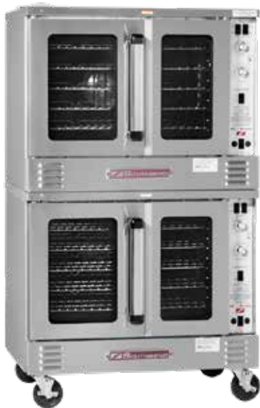
SLGS/22SC shown with optional casters